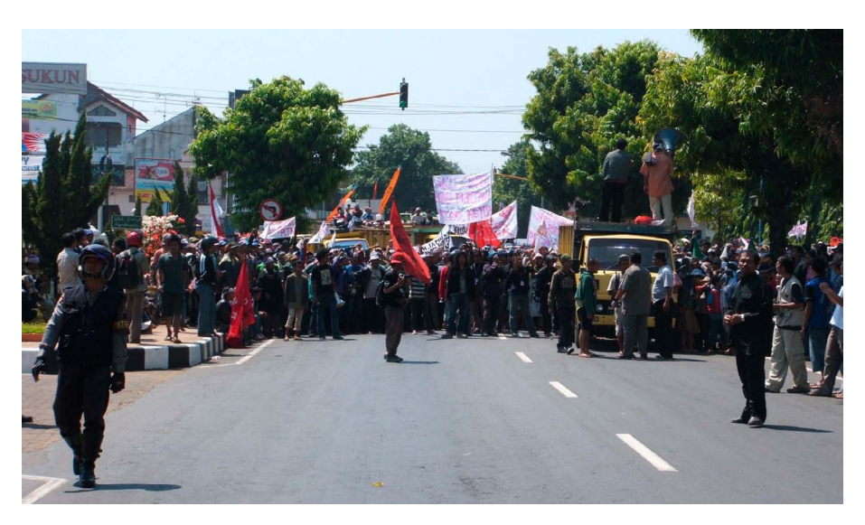
Mass protest in Jepara, September 2007

June 2007, several massive protests comprised of thousands of participants erupted not only in Balong village and Jepara's capital, but also in neighbouring Kudus and Pati.<sup>46</sup> En masse, people gave voice to public distrust of the nuclear power agenda as well as the geological, technological, environmental and institutional soundness supposedly underlying it (Amir 2010b, p. 128).<sup>47</sup> A program organized by Technology Ministry, which would use funds from the nuclear socialization budget to send pro-nuclear Commission VII mem-