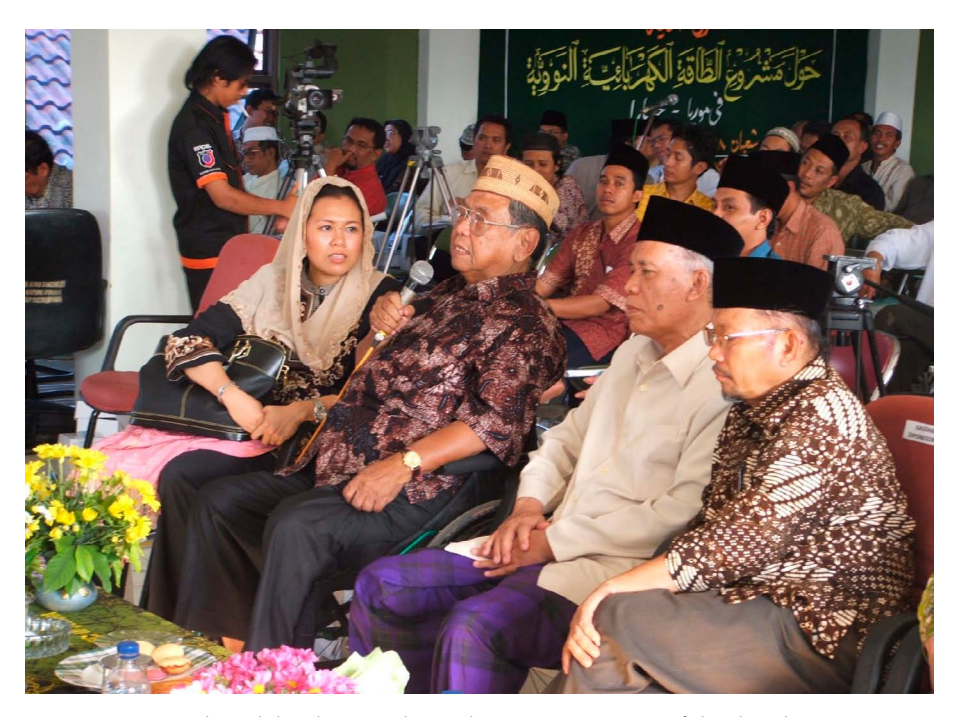
Former President Abdurrahman Wahin at the opening ceremony of the clerics' meeting, September 2007

works that had emerged in 2007 were also strengthened by the establishment of Jaringan Alam Lestari Muria (Network for Sustainable Muria, Jalamuria) in December 2008. Functioning as an umbrella organization for more than 50 anti-nuclear groups in three districts around the Muria Peninsula, Jalamuria continues to bolster the resistance movement and bring it to national-level decision-makers.<sup>54</sup>